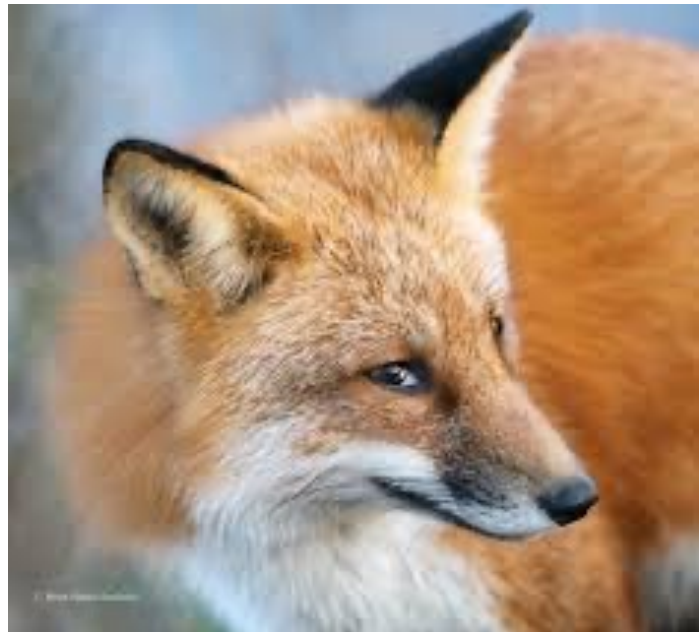
Irene Hinke-Sacilotto, Professional Wildlife Photographer, to speak about "a Passion for Wildlife Photography, the Story Behind the Images "